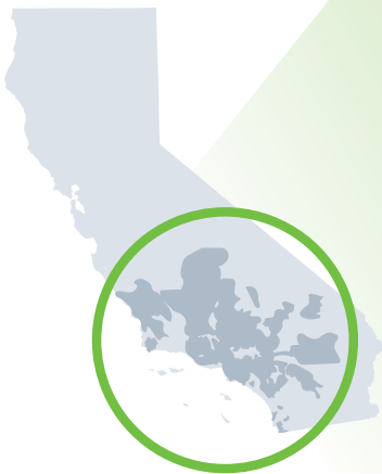
ZOOMED OUT HPN CALIFORNIA COVERAGE MAP

Currently, Heritage and its affiliates manage the health care of approximately 700,000 individuals and contract with approximately 2,300 primary care physicians , 30,000 specialist physicians and over 100 hospitals . Heritage and its affiliates also employ hundreds of physicians at primary care and multi-specialty group clinics that provide direct care for tens of thousands of patients throughout the Southland and surrounding areas.